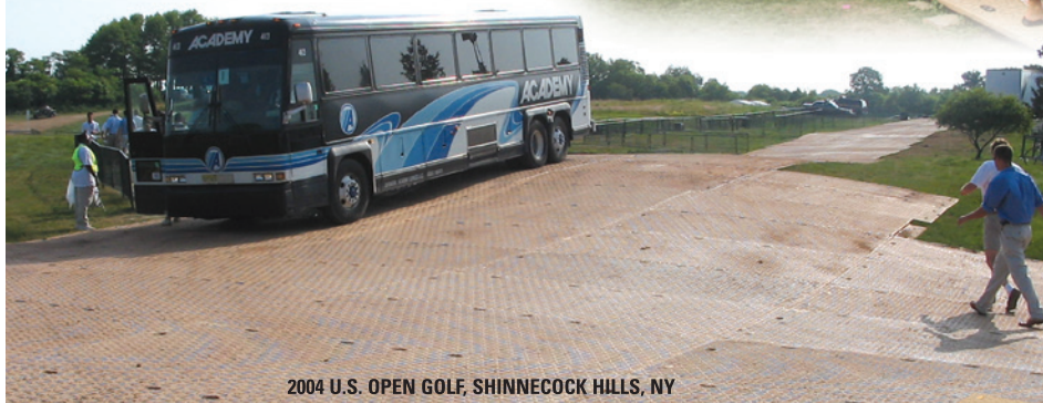
2004 U.S. OPEN GOLF, SHINNECOCK HILLS, NY