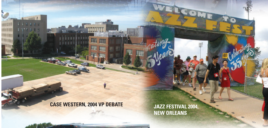
JAZZ FESTIVAL 2004, NEW ORLEANS